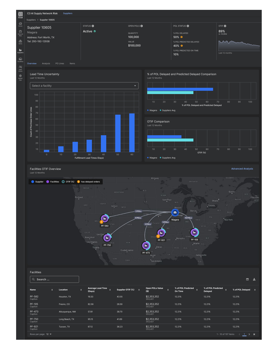
Figure 2. C3 AI Supply Network Risk enables supply chain managers to identify orders at risk due to supplier delays and view key KPIs such as OTIF across the customer base

C3 Al Supply Network Risk can be configured and deployed across a wide range of industries such as energy, process or discrete manufacturing, agribusiness, healthcare, and retail among others. C3 Al Supply Network Risk is interoperable with other C3 Al Supply Chain Suite applications.