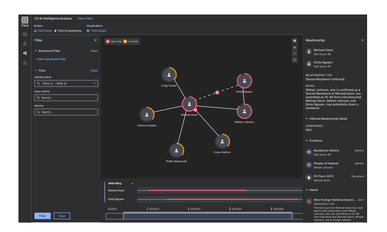
Figure 2. C3 Al Intelligence Analysis – Link Analysis visualizes and surfaces key relations and transactions.